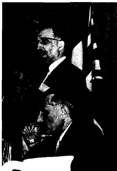
Louis Finkelstein addresses the 1957 United Synagogue convention.

In 1944, joint fund-raising was placed under a new banner, "The Campaign for the Jewish Theological Seminary of America, in cooperation with the Rabbinical Assembly and the United Synagogue." Under this arrangement, all fund-raising by the three organizations was merged into one campaign, which developed an apparatus to reach some ten thousand donors. 37 Most important for relations between JTS and the arms of the Conservative movement, the three partners created a Liaison