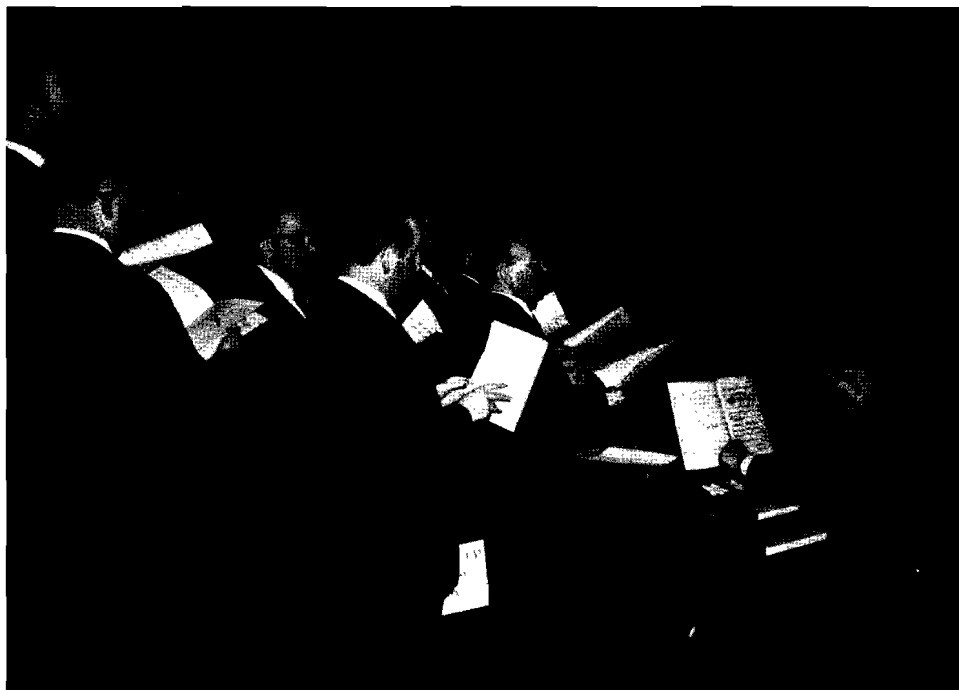
Men's choir with organ at the Brooklyn Jewish Center, 1960s.