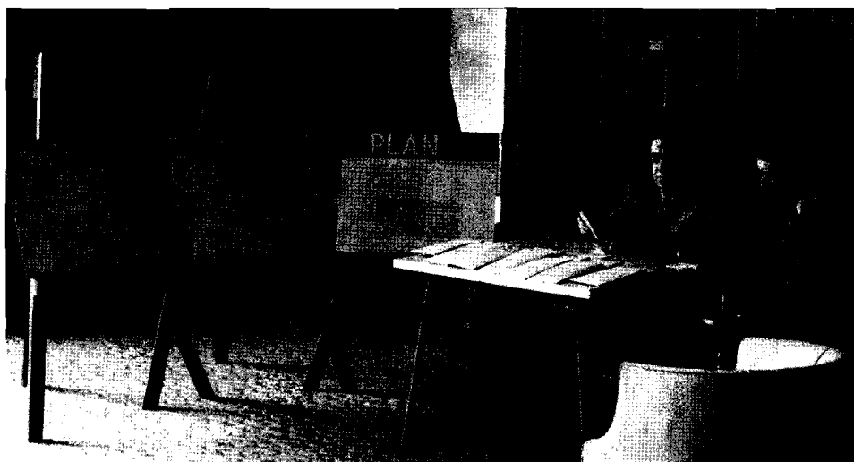
National Enrollment Plan display at a United Synagogue convention, 1957.

TORCH and its programs to underwrite educational ventures spearheaded by the Seminary, such as the Leadership Training Fellowship and Ramah Camps, the NFJMC also became a partner of JTS, although it was long treated as a very junior partner. 61