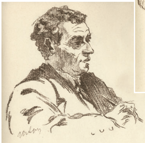
Sketches of the United Opposition: (TOP) Leon Trotsky, (CENTER) Grigory Zinoviev, (BOTTOM) Lev Kamenev.