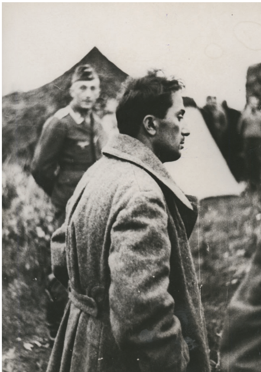
Photograph of Yakov Dzhughashvili (Stalin's son) in German captivity.