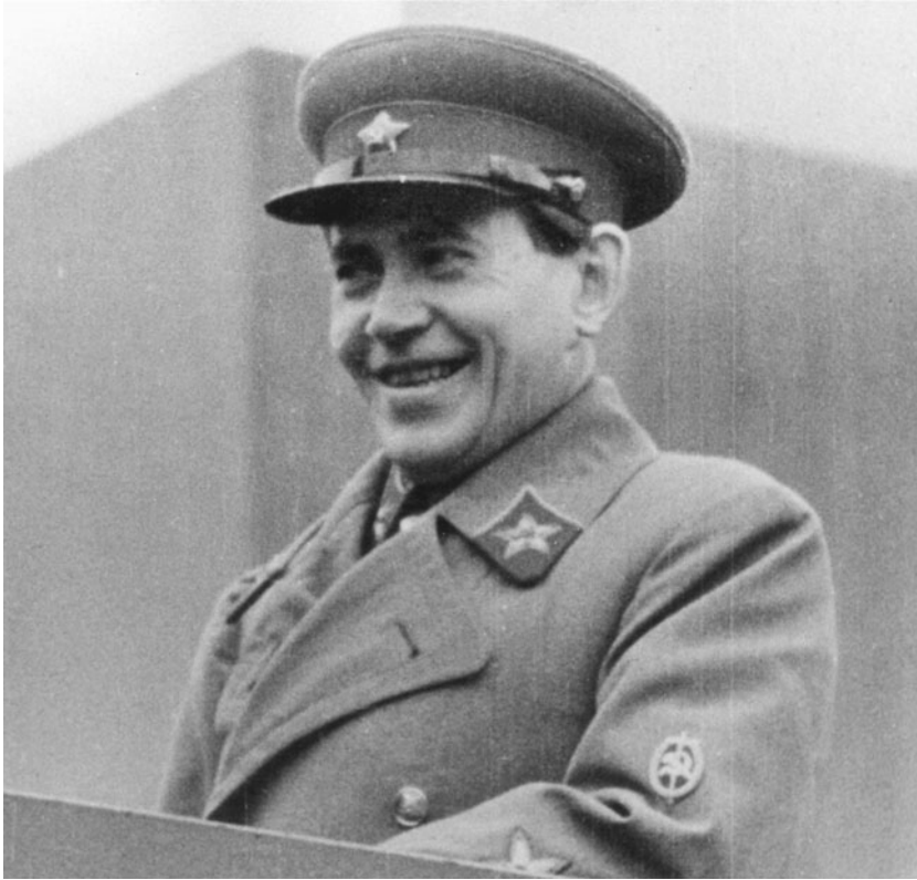
Photograph of Nikolai Ezhov on top of the Lenin Mausoleum, May 1, 1938.

Nikolai Ezhov as head of the NKVD. Over the next year, Stalin and Ezhov prepared the “once and for all time” elimination of enemies of Soviet power.