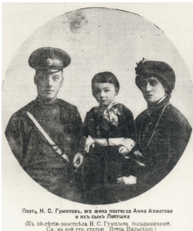
Photograph of poet Anna Akhmatova and family, including repressed son (Lev) as a boy.

On the basis of the decision by the KGB of August 24, 1955, an instruction was issued that local KGB offices tell relatives of those sentenced to death that they were sentenced to ten years and died in captivity. In necessary cases, the death can be registered and a death certificate issued. 2