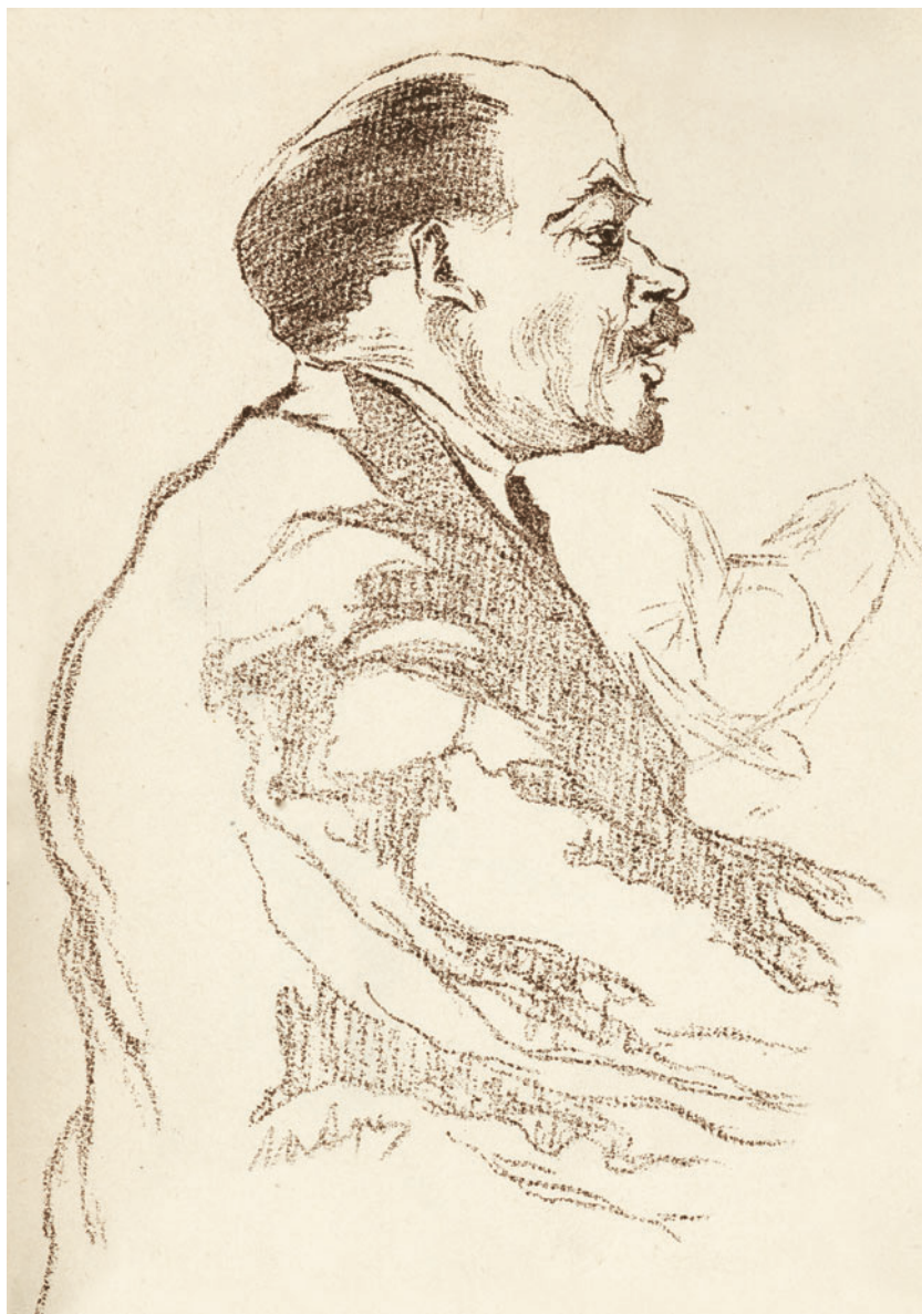
Sketch of Lenin showing his prominent forehead, presumably a sign of genius.