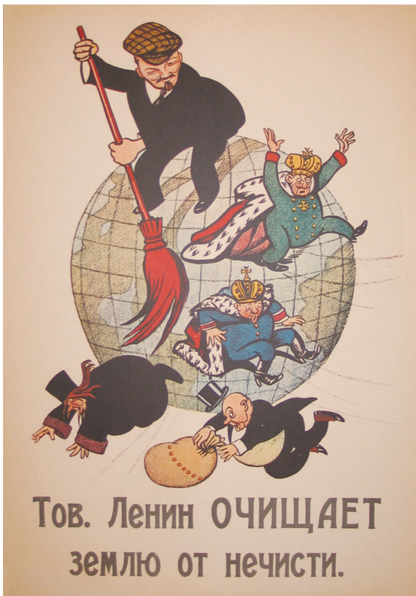
Poster of Lenin sweeping away marginals and former people, entitled "Lenin purges the land of the unclean."