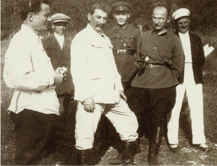
Stalin at the hunt with his comrades.