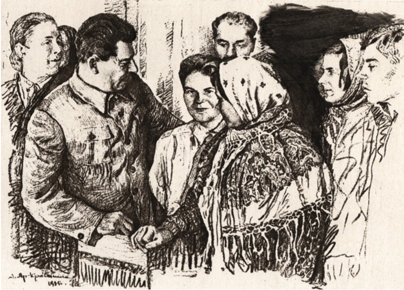
Poster of Stalin with a happy group of collective farmers (many of whom were punished for petty thefts from the fields under his anti-theft campaigns).

not “arrest” the property of the accused, giving the thief an opportunity to conceal the stolen property. 2