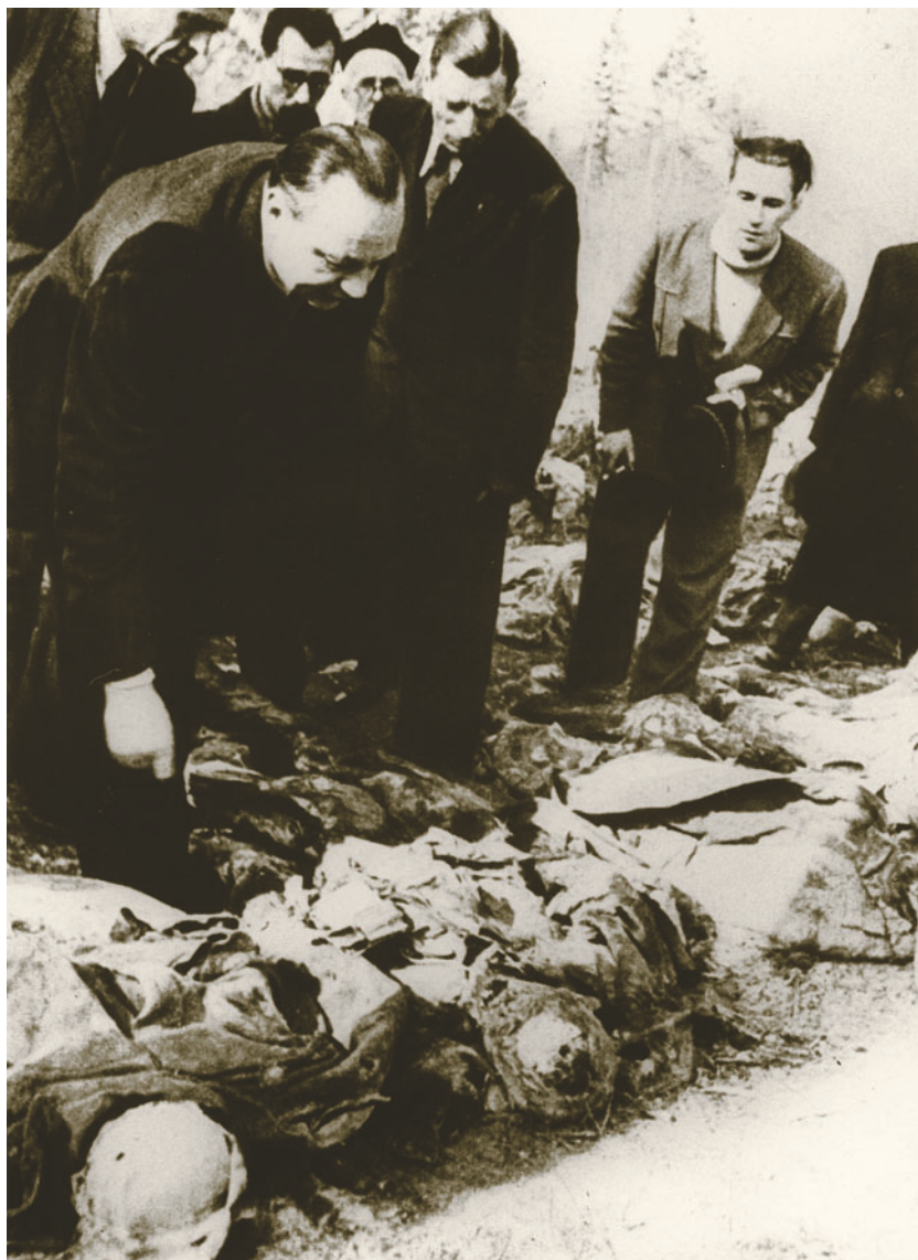
Photograph of site of Katyn massacre, located in the vicinity of Smolensk.