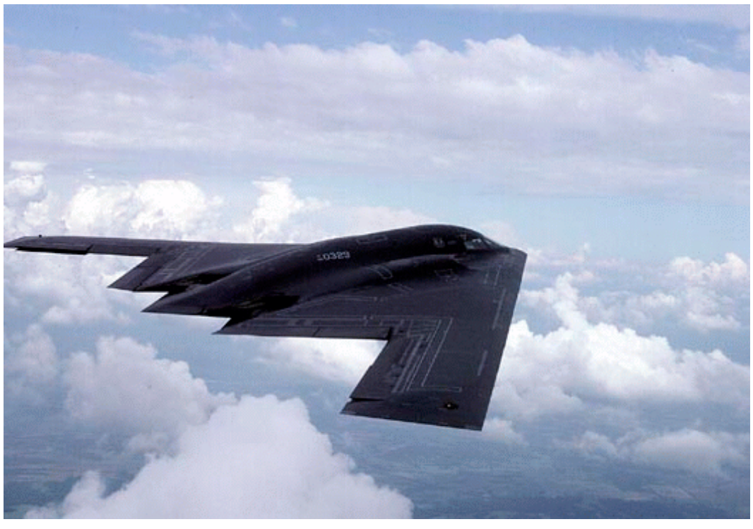
Figure 4. B-2 Spirit

The B-2 is slower and has a smaller payload than the other bombers, but its role is different because of its stealth. It is the only bomber capable of operating in well-defended airspace and is intended for early strikes in a conflict. The B-2, along with the F/A-22, is the centerpiece of the Air Force's "Global Strike Task Force" concept, which is designed to attack "anti-access" targets in future conflicts, opening the way for follow-on platforms like the Joint Strike Fighter and the other bombers. <sup>105</sup>