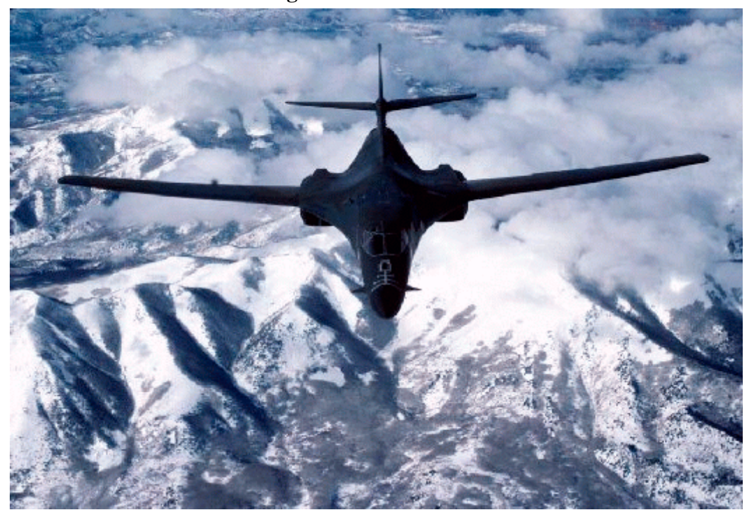
Figure 3. B-1B Lancer

Like all the long-range bombers currently serving in the Air Force, the B-1B was designed to carry nuclear weapons deep into Soviet territory during the Cold War. The plane's supersonic speed, reduced radar signature, and large payload gave it important advantages over the B-52, even though its range was shorter. Since the end of the Cold War, the Air Force has adapted the B-1B to carry conventional weapons, although its value in conventional warfare has only been tested in the recent conflicts in Afghanistan (2001) and Iraq (2003). The B-1B has the largest payload capacity of the three bombers and can carry a broad array of precision and non-precision weapons. Ongoing upgrades will increase the variety of weapons it can carry and will enable it to deliver three different munitions to separate targets in a single sortie, a first among U.S. warplanes.