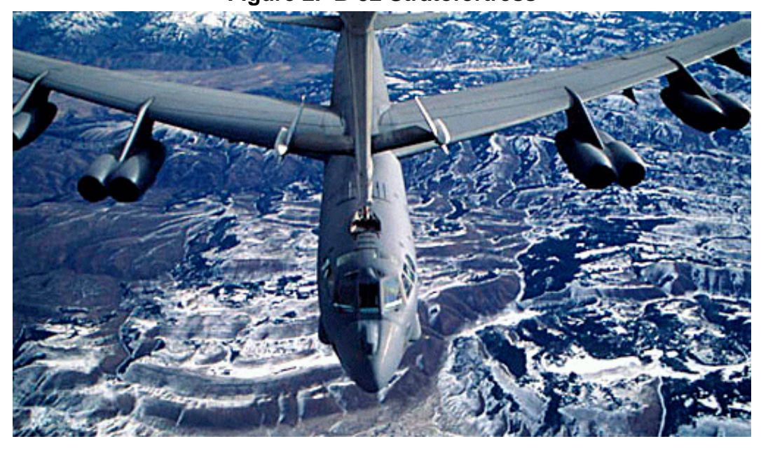
Figure 2. B-52 Stratofortress

The 40-year-old B-52 has remained relevant to a changing battlefield. Although nuclear strikes were its primary mission during the Cold War, the B-52 has carried out important non-nuclear missions in conflicts going back to the Vietnam War. Air Force Secretary James Roche stated recently that the B-52 has transformed three times in its history, from a high-level bomber to a low-level intruder to a stand-off cruise missile carrier to a close air-support aircraft. The B-52 is the only platform that can operate with more than 20 types of bombs and cruise missiles in the U. S. inventory. In high-threat areas where enemy defenses are robust, B-52s employ airlaunched cruise missiles (20 per aircraft) to attack ground targets from a distance. In low-threat environments such as Afghanistan or Iraq, B-52s can use JDAM precision bombs or various gravity bombs.