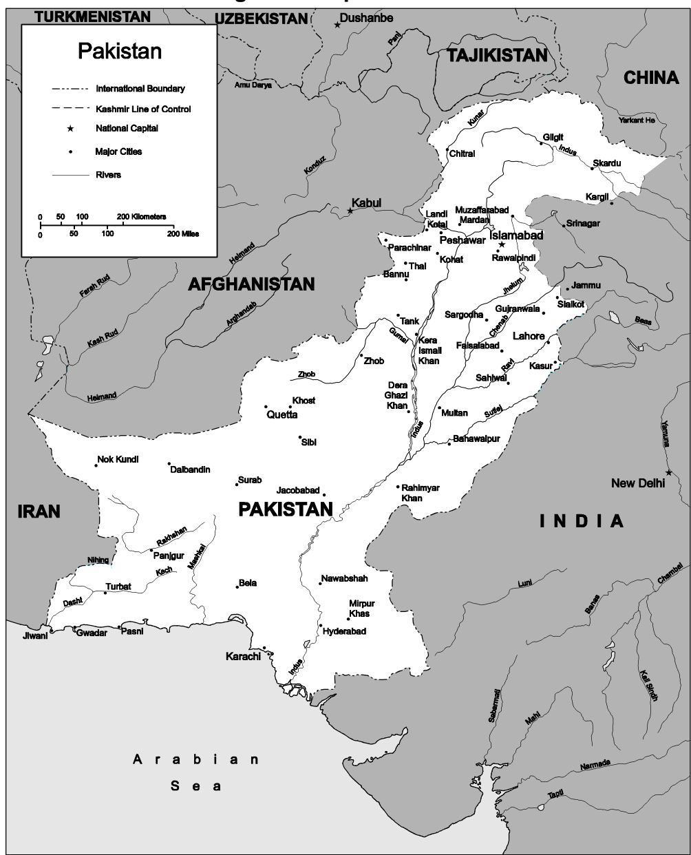
Figure 2. Map of Pakistan