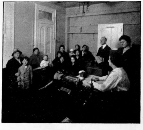
The Children's Clinic.

Medical, Clinic: One of the most important activities of the Institute now is the Medical Clinic. This is under the personal supervision of the ablest physicians in Kansas City and serves on an average of thirty patients daily. The work is