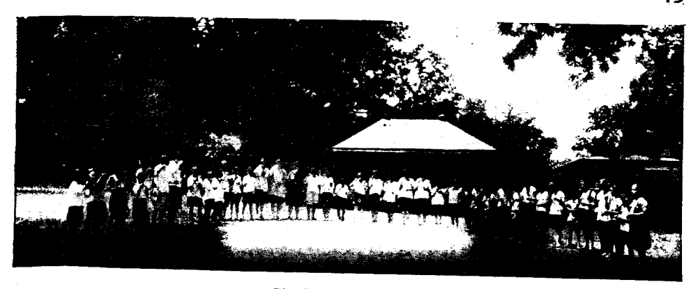
The Tooth Brush Drill

The organization started with a membership of one hundred and fifty girls. It has fulfilled its intention in so far as the girls have met and have become better acquainted and many close and lasting friendships have been formed. It has given them a definite agreeable meeting place and has disclosed and developed much talent. As soon as an adequate building is supplied, it will function fully and properly.