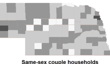
per 1,000 households None present: 0 Low: 0.01 – 2.99 Med: 3 – 4.99 High: 5+

Using data from the U.S. Census Bureau, this report provides demographic and economic information about same-sex couples and same-sex couples raising children in Nebraska. We compare same-sex "unmarried partners," which the Census Bureau defines as an unmarried couple who "shares living quarters and has a close personal relationship," to different-sex married couples in Nebraska.<sup>1</sup>