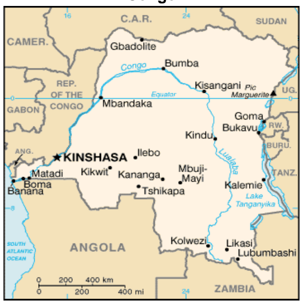
Figure 2. Democratic Republic of the Congo

In July 1999, at a summit in Lusaka, Zambia, the leaders of Uganda, Rwanda, Democratic Republic of the Congo, Zimbabwe, Namibia, and Angola signed a peace agreement. The agreement called for a cease-fire within 24 hours of the signing of the agreement. Nonetheless, both sides to the conflict consistently violated the ceasefire agreement. The Lusaka Accords established a joint military commission (JMC) to investigate cease-fire violations and to disarm militia groups. The withdrawal of foreign forces from Democratic Republic of the Congo was one of the key elements of the Lusaka Accords. The Accords also called for political dialogue among Congolese political and armed groups to settle their differences peacefully and to map out a new political chapter for Democratic Republic of the Congo. The former president of Botswana, Sir Ketumile Masire, was appointed to facilitate the talks.