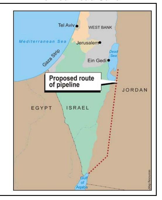
The Red-Dead Canal

settlement that addresses the Dead Sea border and water rights, Israel and Jordan, which concluded a bilateral peace treaty in 1994, will disproportionately benefit from the canal at the expense of the Palestinians.