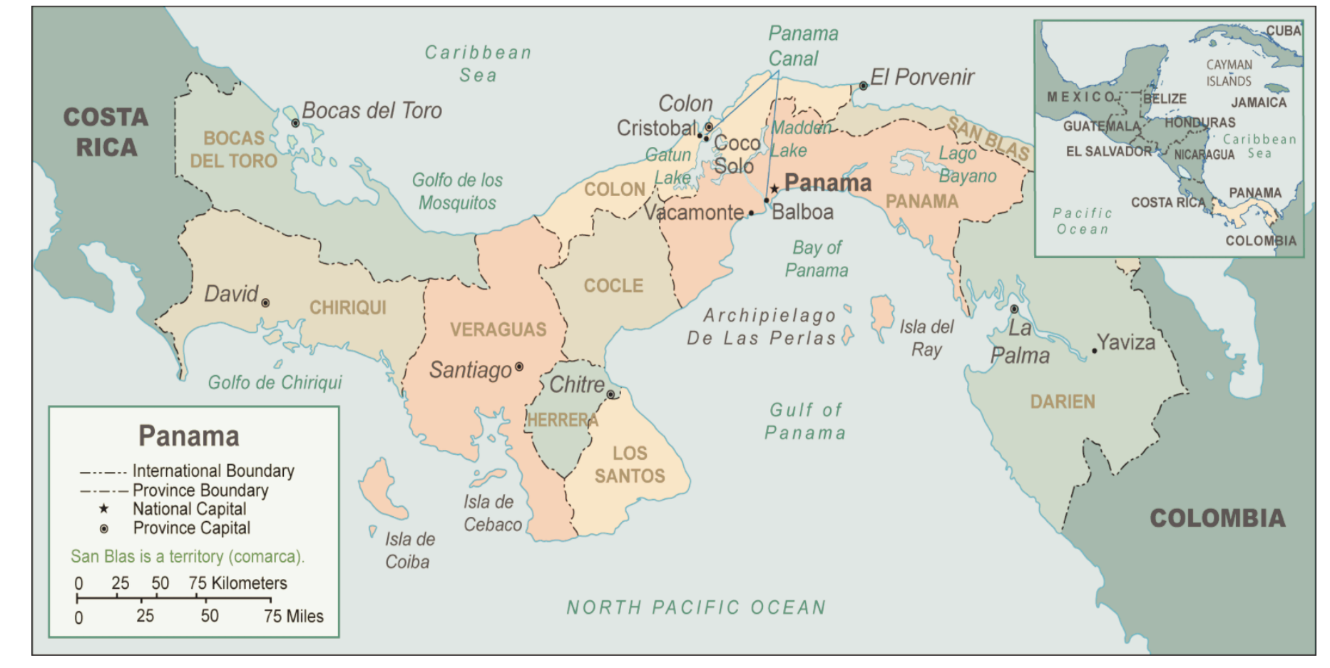
Figure I. Map of Panama