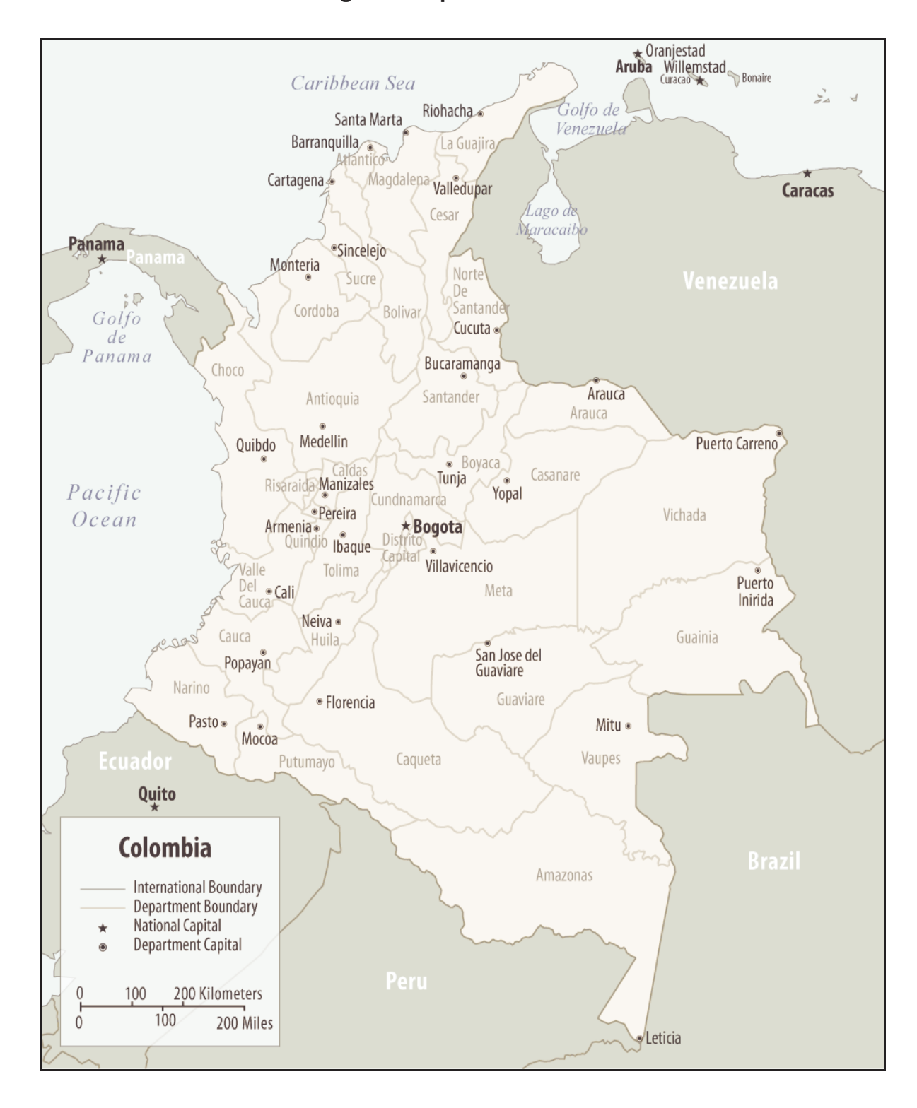
Figure I. Map of Colombia