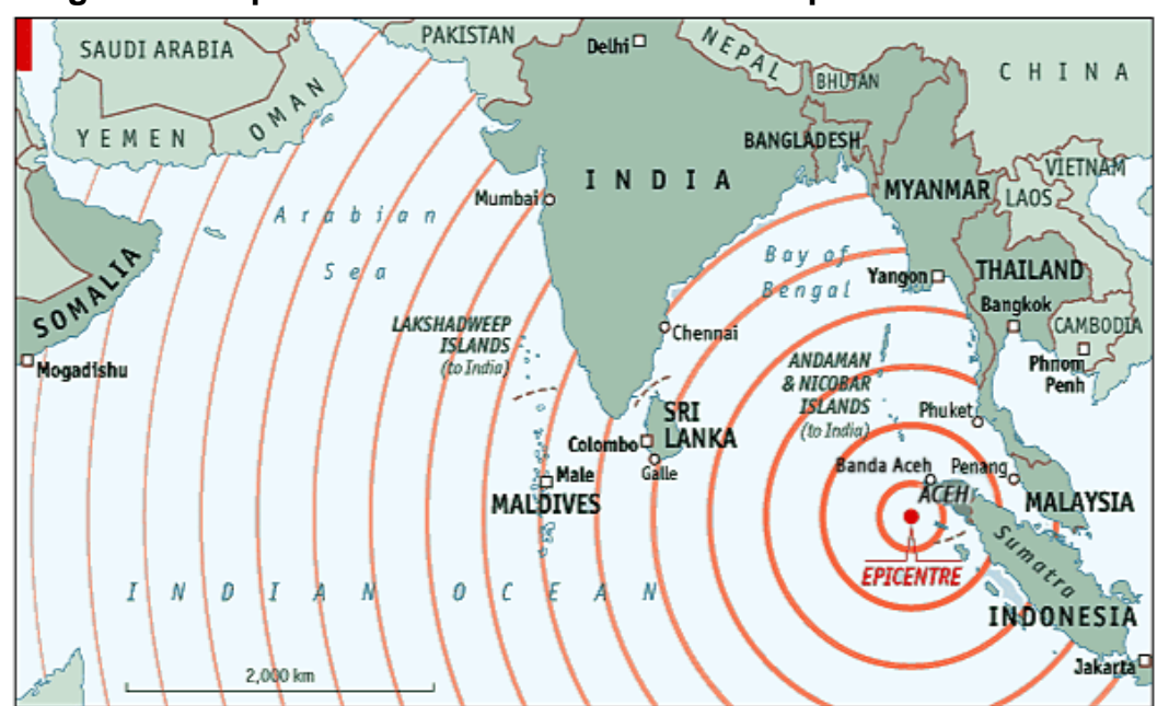
Figure 1. Map of the 2004 Indian Ocean Earthquake and Tsunami