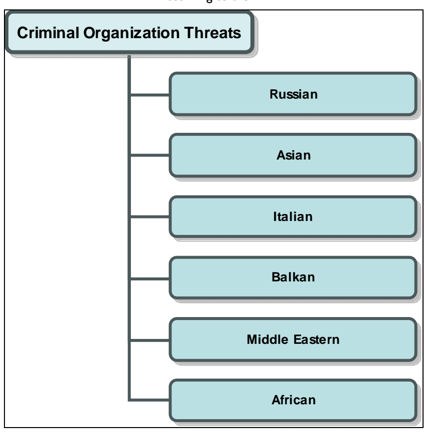
Figure 3. Organized Crime Threats in the United States