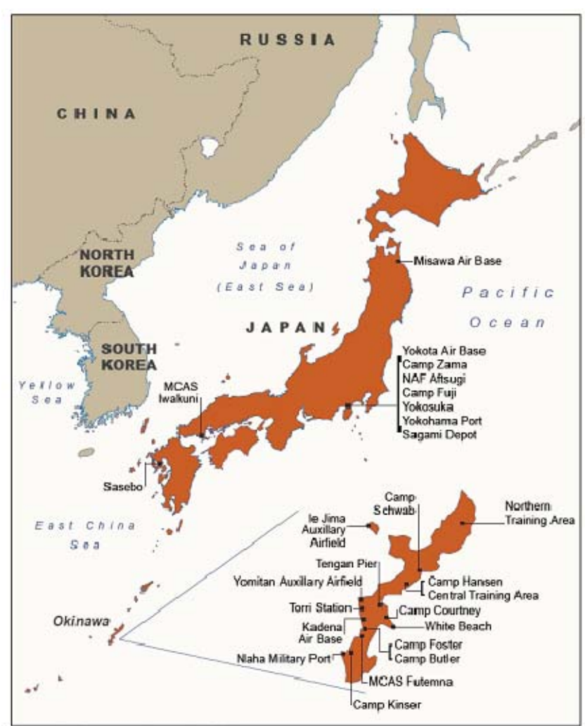
Figure 2. Map of Military Facilities in Japan

In general, Japan's U.S.-drafted constitution remains an obstacle to closer U.S.-Japan defense cooperation because of a prevailing constitutional interpretation of Article 9 that forbids engaging in "collective self-defense"; that is, combat cooperation with the United States against a third country. Article 9 outlaws war as a "sovereign right" of Japan and prohibits "the right of belligerency." Whereas in the past Japanese public opinion strongly supported the limitations placed on the Self-Defense Force (SDF), this opposition has softened considerably in recent years. The new ruling coalition in Tokyo remains deeply divided on amending Article 9 of the constitution and is unlikely to take up deliberation of the issue in the near term. Since 1991, Japan has allowed the SDF to participate in non-combat roles in a number of United Nations peacekeeping missions and in the U.S.-led coalition in Iraq.