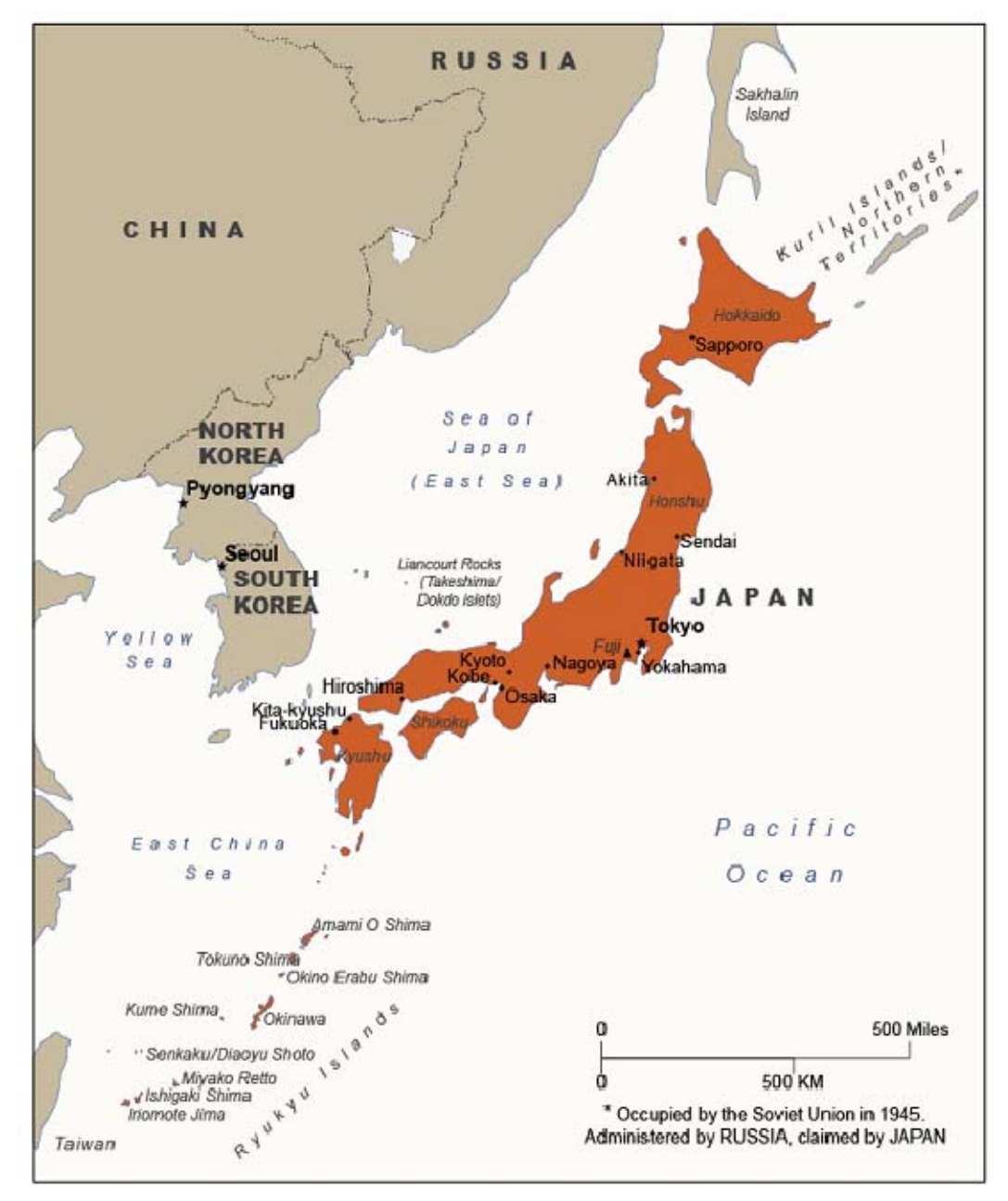
Figure 1. Map of Japan

Congressional powers, actions, and oversight form a backdrop against which both the Administration and the Japanese government must formulate their policies. In the 111<sup>th</sup> Congress, Members' attention to Japan may be most concerned with the status of the military alignment plans in the region. In the 109<sup>th</sup> and 110<sup>th</sup> Congress, hearings and legislation concerning Japan focused on thorny history issues as well as the U.S. beef import ban.