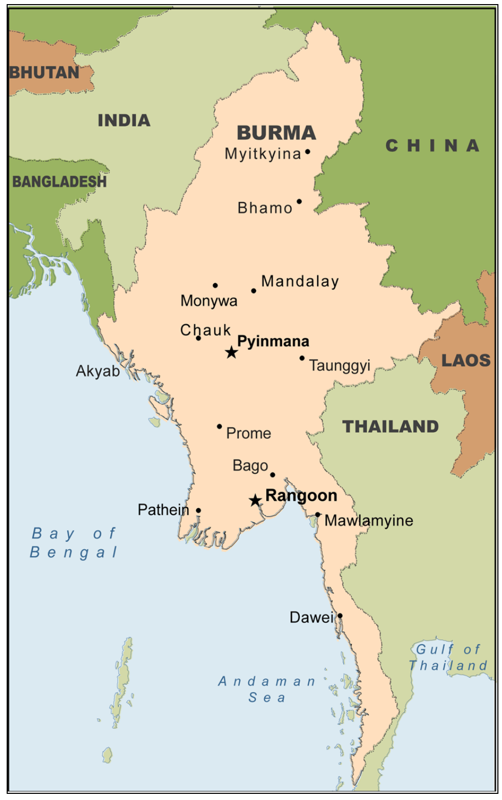
Figure 2. Map of Burma