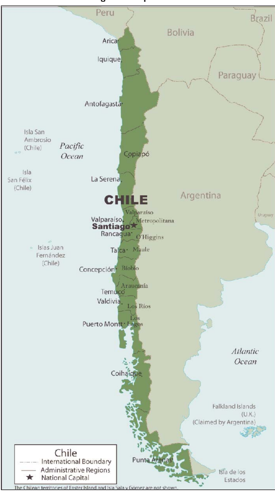
Figure I. Map of Chile