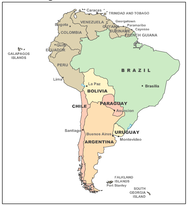
Figure 4. South America