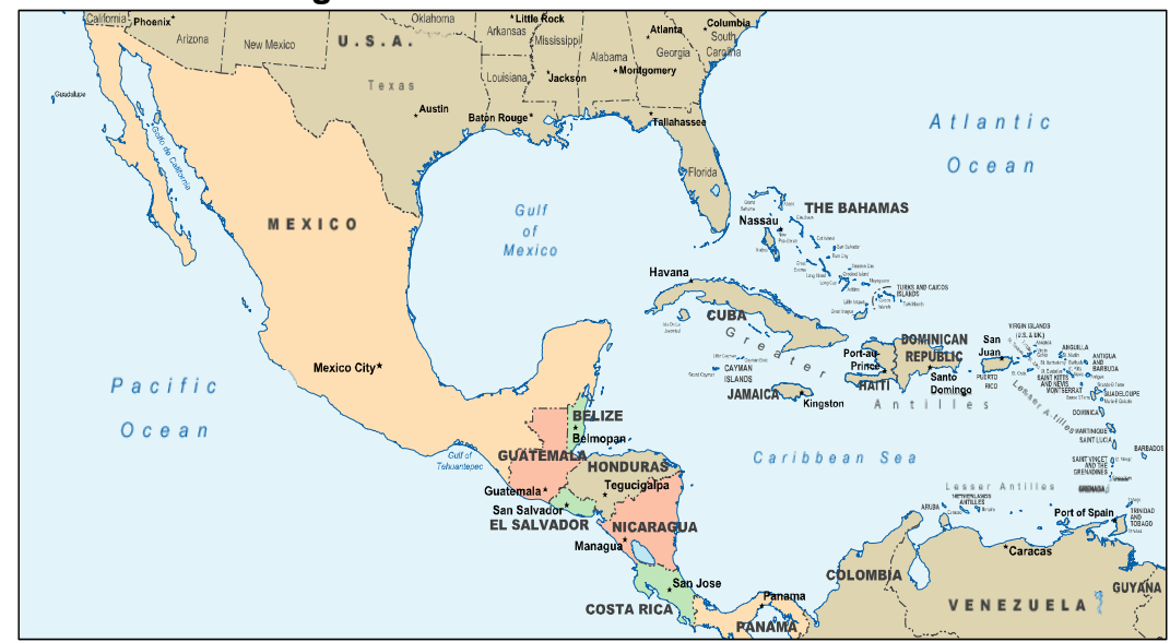
Figure 5. Mexico and Central America

a. Brazil receives ACI funding because it shares a 1,000 mile border with Colombia, although it is not considered an Andean nation.