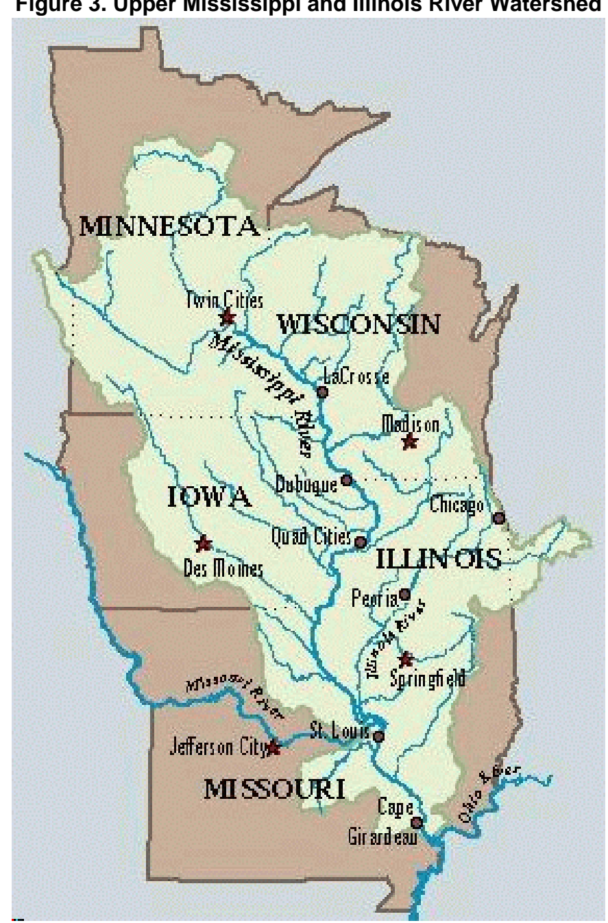
Figure 3. Upper Mississippi and Illinois River Watershed