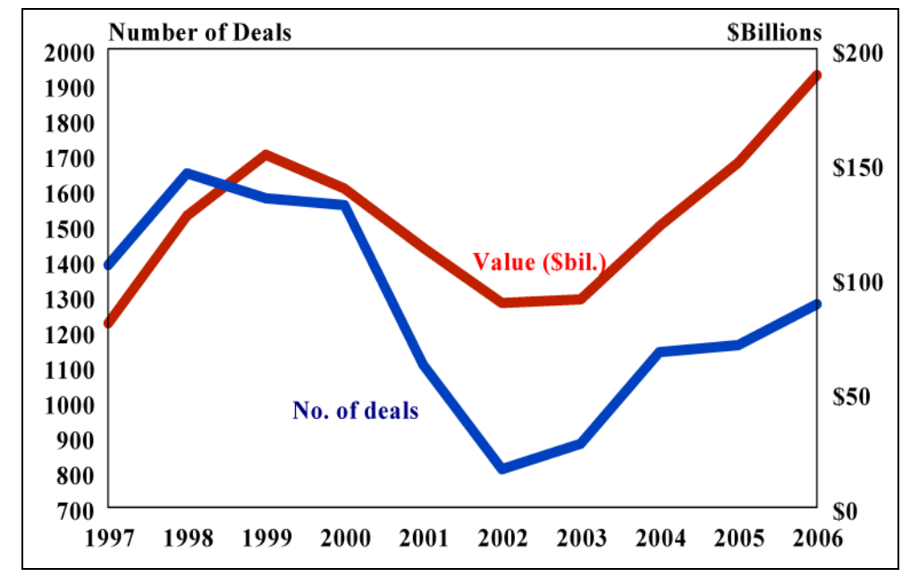
Figure 2. U.S. Acquisitions of Foreign Companies

Another notable feature of the data is the way in which foreign acquisitions of U.S. firms and U.S. acquisitions of foreign firms seem to rise and fall in tandem. As the rate of U.S. economic growth slowed in the early 2000s, acquisition activity slowed not only in the United States, but for U.S. acquisitions abroad as well. Figure 2 and Figure 3 show the number of deals and the value of those deals for U.S. acquisitions of foreign firms and foreign acquisitions of U.S. firms, respectively. In both cases, the number of deals and the value of those deals dropped between 2000 and 2002 for both U.S. and foreign firms before activity rebounded after 2002. Such similarities in the acquisition activity of U.S. and foreign firms seem to be counter-intuitive in that those forces that draw U.S. firms to invest abroad should theoretically be separate from those factors that draw foreign firms to invest in the United States.