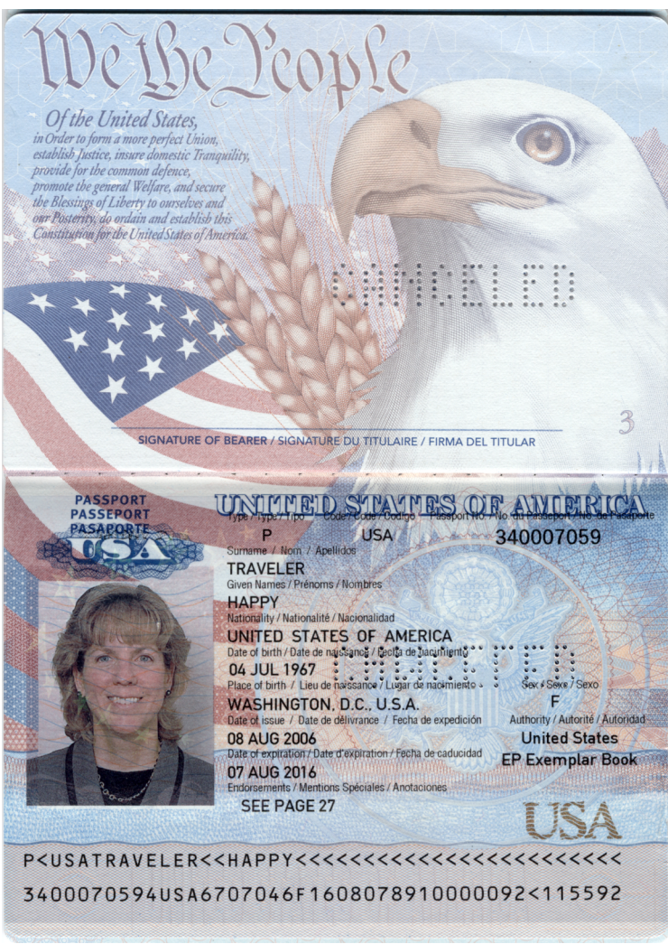
FIGURE 2: THE PASSPORT BIOGRAPHICAL PAGE WITH DIGITAL PHOTOGRAPH