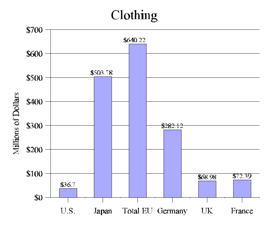
Figure 1. Imports from Vietnam, Selected Countries & Products