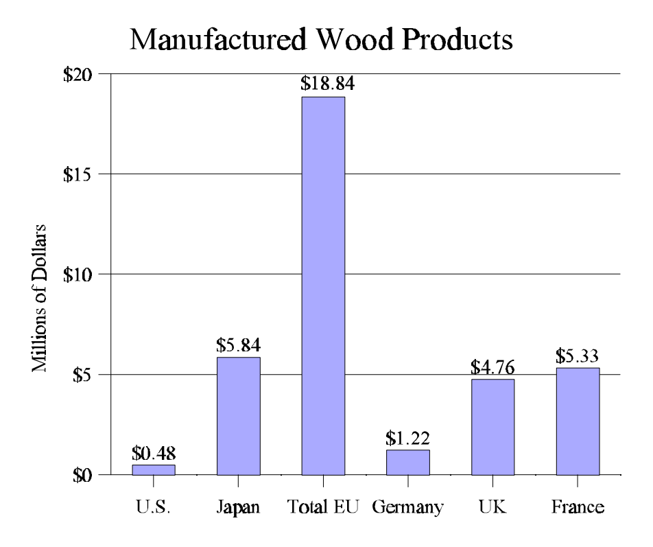
U.S. International Trade Commission, EUROSTAT, and Japan Tariff Association)

The BTA agreement contains no provisions on Vietnamese textile exports to the U.S., but the safeguard provision would allow the U.S. to impose quotas on textile imports in the event of a surge of imports. In private, U.S. and Vietnamese officials have said they expect to begin negotiating a bilateral textile agreement, which presumably would set quotas for Vietnamese textile exports, soon after a Congressional vote on the BTA. In the case of Cambodia, the U.S. has applied quotas on most clothing imports, significantly reducing the annual increase in imports of Cambodian apparel items.